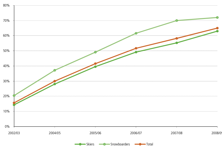
2 Helmet-wearing quota for skiers and snowboarders according to winter season

In the 2008/09 winter season, 2/3 of skiers and snowboarders wore a snowsport helmet. In contrast to previous years, the age difference was far less pronounced. However, as before, it was mainly younger snow-sportsmen and women who wore a helmet. In contrast, the difference in helmet-wearing quotas between German- and French-speaking regions of Switzerland is becoming ever greater (72 % vs. 46 %).